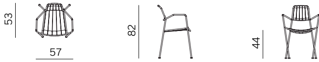
CHAIR WITH WOODEN SEAT & BACKREST / STOLICA S DRVENIM SJEDALOM I NASLONOM